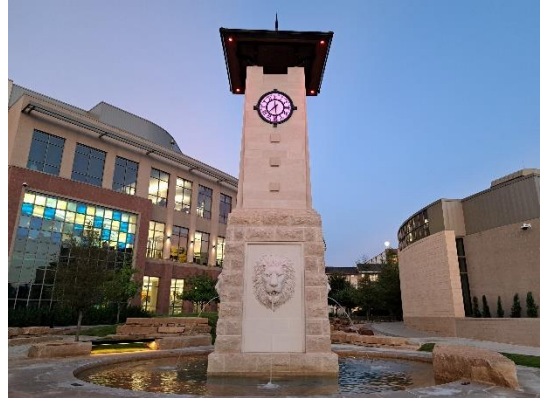
Mineral Well Public Plaza

On September 16, a ceremony was held for the newly constructed Mineral Well Public Plaza. The space features a 40-foot clock tower and water fountain paying tribute to Arlington’s Mineral Well, which existed from 1892 until it was capped in 1951. The new public space is located near the original Mineral Well site and features landscaping, an area for seating, and is also a gathering place.