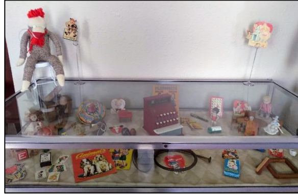
Recognize any of these antique toys?