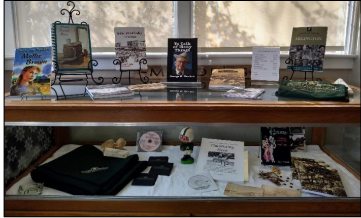
For sale at Fielder

Proceeds benefit the Arlington Historical Society.