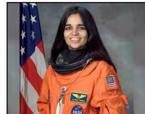
Dr. Kalpana Chawla

Kalpana Chawla , born in Karnal, India, graduated from UTA in 1984 with a master's degree. She then earned a doctorate in aerospace engineering from the University of Colorado in 1988. Dr. Chawla joined NASA in 1994, and later, in 1997, became the first Indian woman to travel into space. Last month, Arlington remembered and honored Dr. Chawla's legacy on the 20th anniversary of her tragic death. She was one of the seven crew members who died in the Space Shuttle Columbia disaster on February 1, 2003. UTA honors Dr. Chawla with an on-campus memorial, a residence hall, and a scholarship.