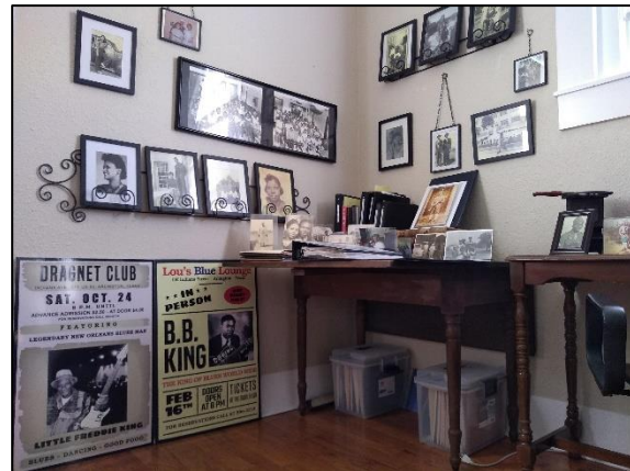
Black History exhibit at Fielder

Our Black History exhibit continues to grow. It now contains many photos, books, memoirs, files, cemetery records, funeral programs, and recorded interviews. Fairly recent additions include concert posters from the Dragnet Club and Lou's Blue Lounge, located in The Hill.