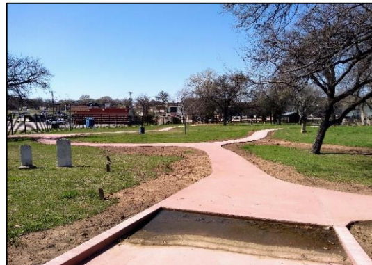
View from cemetery entrance, 03-04-23

Did you know that besides being one of the Arlington Historical Society's venues, the cemetery is also a City of Arlington Local Landmark?