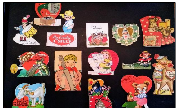
Happy Valentine's Day from Fielder Museum