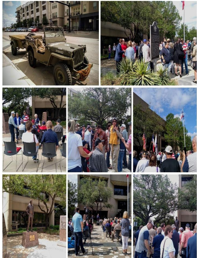
WWII Memorial Dedication – event photos