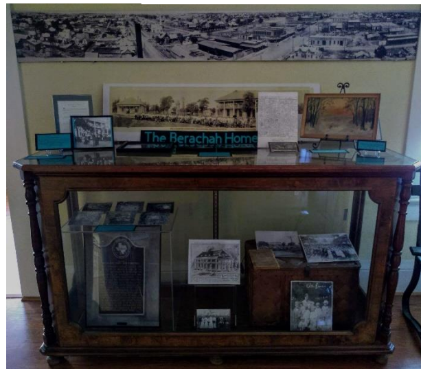
The Berachah Home exhibit

We also expanded our Black History exhibit at Fielder House. The display includes photos, mementos, stories, interviews, oral histories, and a collection of funeral programs –